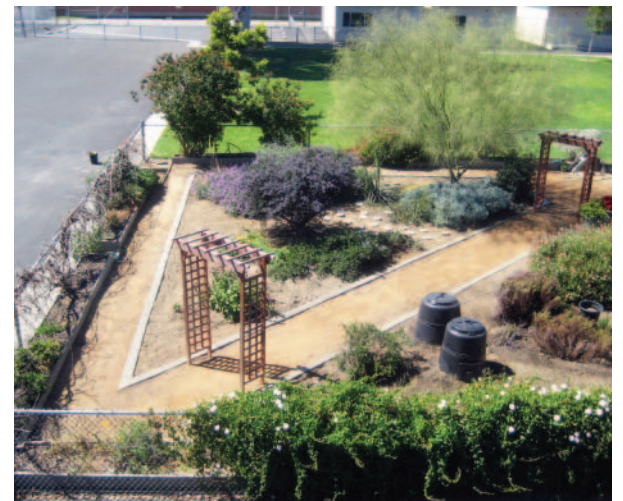
Bixby Elementary completed garden

The real work began when Troop 212 prepared the grounds by digging out trenches, transplanting plants, and pulling out the weeds. Next, they poured concrete into foundations they constructed to form the beautiful borders around the garden areas. The borders provided an attractive, designated walking path around the garden. Troop 212 also poured the foundation for two arched trellises which will look amazing when the ivy and grape leaves begin to grow and intertwine around them. The scout troop also cleared a