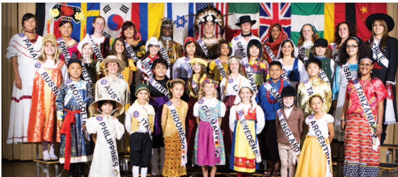
Does your child enjoy singing and dancing? Please see page 6.